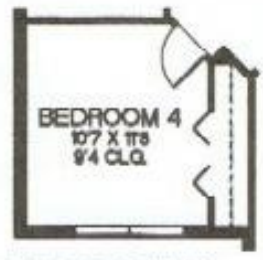
BEDROOM #4 OPTION